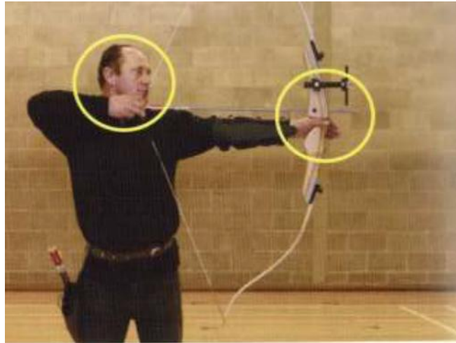
Freestyle shooting style