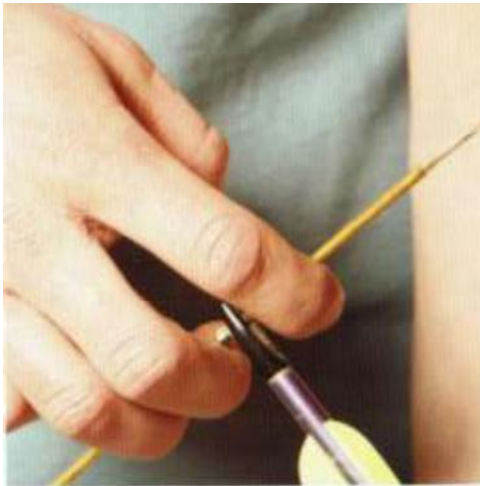
Freestyle finger placement

One of the main difference between barebow and freestyle shooting, is the placement of your fingers. Observe that with freestyle you have one finger above the nocking points and two beneath.